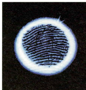
Kirlian photo on the left shows streamers and balls as electrons enter and leave finger.