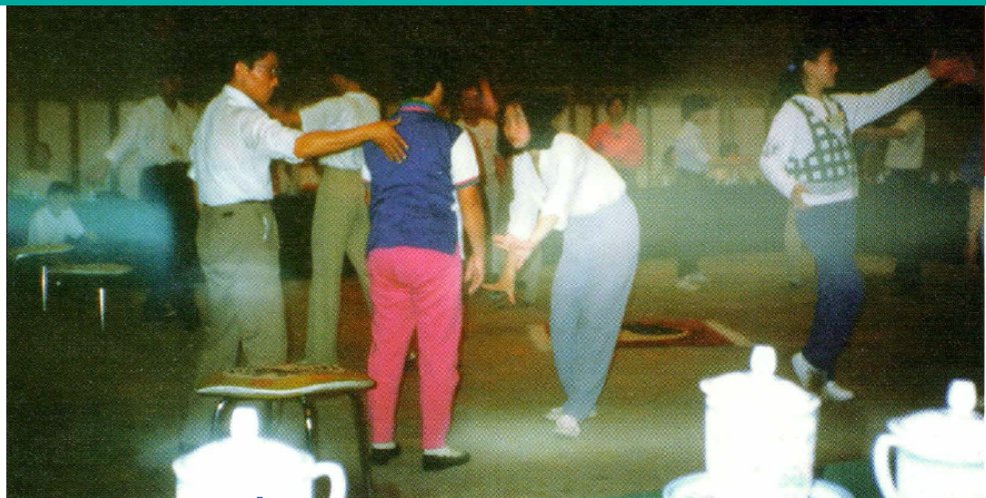
Clouds of light are photographed as Qigong healers "open the meridians" of participants of CHI Tour '96 in Beijing China. No special lighting effects were used.