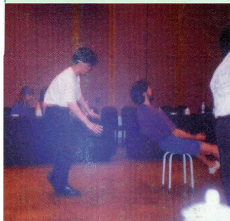
Note that in this photo the light has moved away from the student, following the hands of the Qigong therapist.