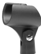
This Clip Holder can be discarded