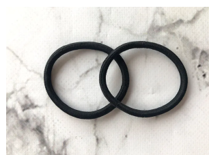
2 Black Securing Bands Taped to you invoice