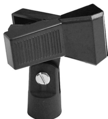
Palm Clip Holder attach to boom arm