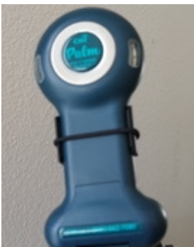
Facing Front View