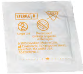
ALCOHOL PREP PAD TO CLEAN THE SURFACE OF YOUR CHI PALM

YOUR CHI PALM MAGNETIC POSITIONING ADAPTER KIT IS PICTURED BELOW