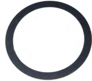
METAL RING W/ADHESIVE TO BE APPLIED TO FACE OF YOUR CHI PALM, OVER THE LOGO