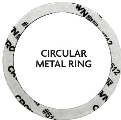
CIRCULAR METAL RING