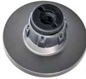
MAGNETIC ATTACHMENT ATTACH TO STAND